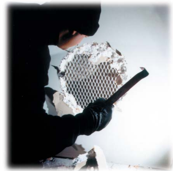
Barrier Mesh BM50, BM75, BM10, BM15